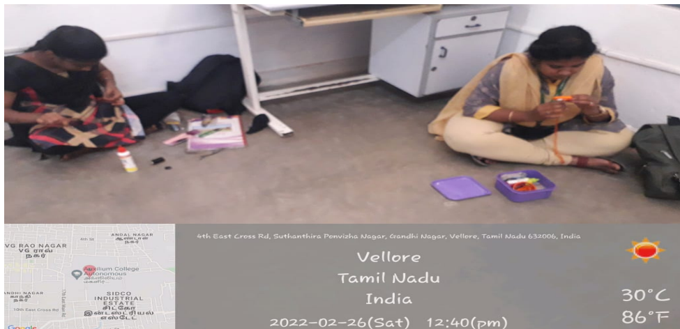
Figure 1: Jewellery Making Competition