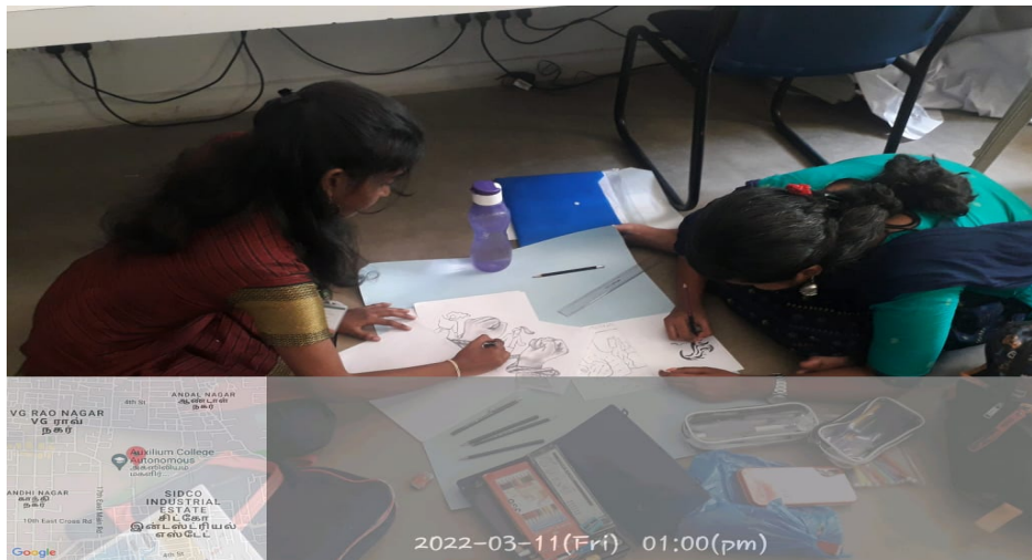
Figure 2: Painting Art Competition on the topic, “Women Empowerment”.