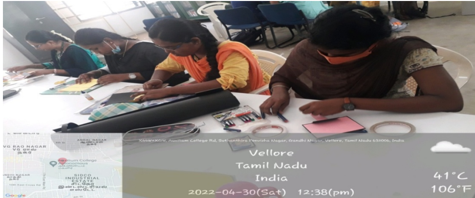
Figure 1: Greeting Card-Making Competition