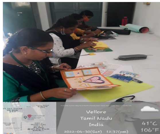
Figure 2: Greeting Card-Making Competition