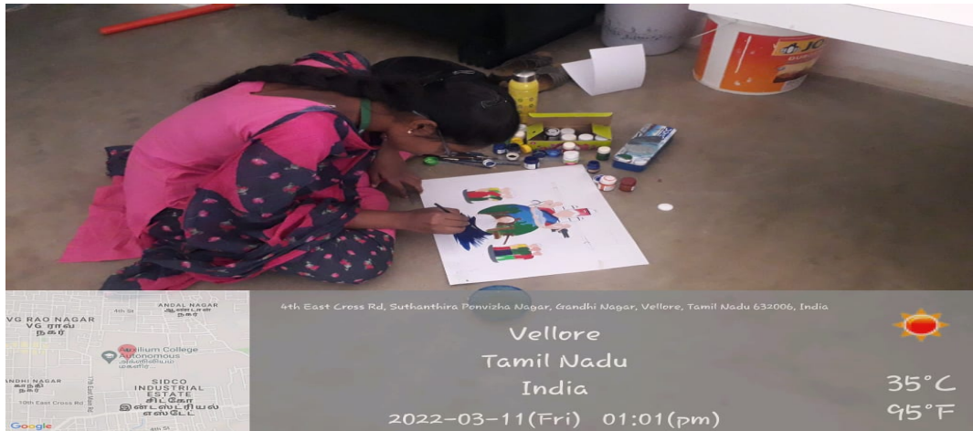
Figure 1: Painting Art Competition on the topic, “Women Empowerment”.